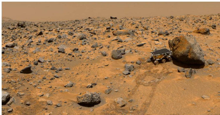
Caption: The Mars Pathfinder lander took this photo of its small rover, called Sojourner. Here, Sojourner is investigating a rock on Mars.

Learn more about the Sojourner rover at the NASA Space Place: https://spaceplace.nasa.gov/mars-sojourner