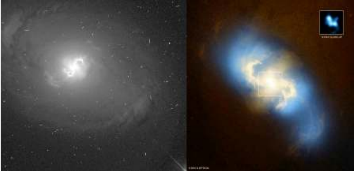
Images credit: NGC 3393 in the optical (L) by M. Malkan (UCLA), HST, NASA (L); NGC 3393 in the X-ray and optical (R), composite by NASA / CXC / SAO / G. Fabbiano et al. (X-ray) and NASA/STScI (optical).

Editors download photo here: http://spaceplace.nasa.gov/review/partners/2015-01/ngc3393.jpg