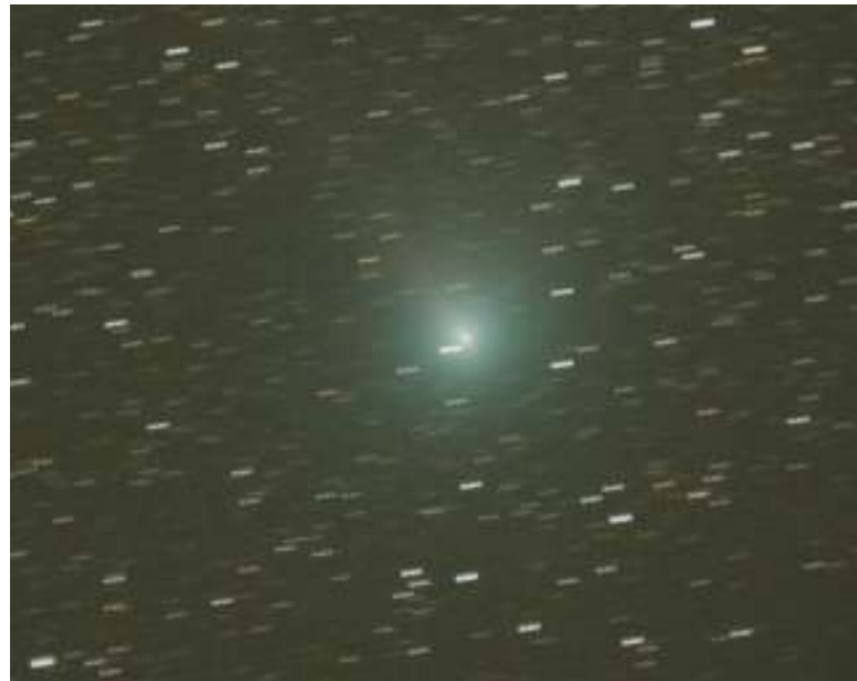
Comet Jacques