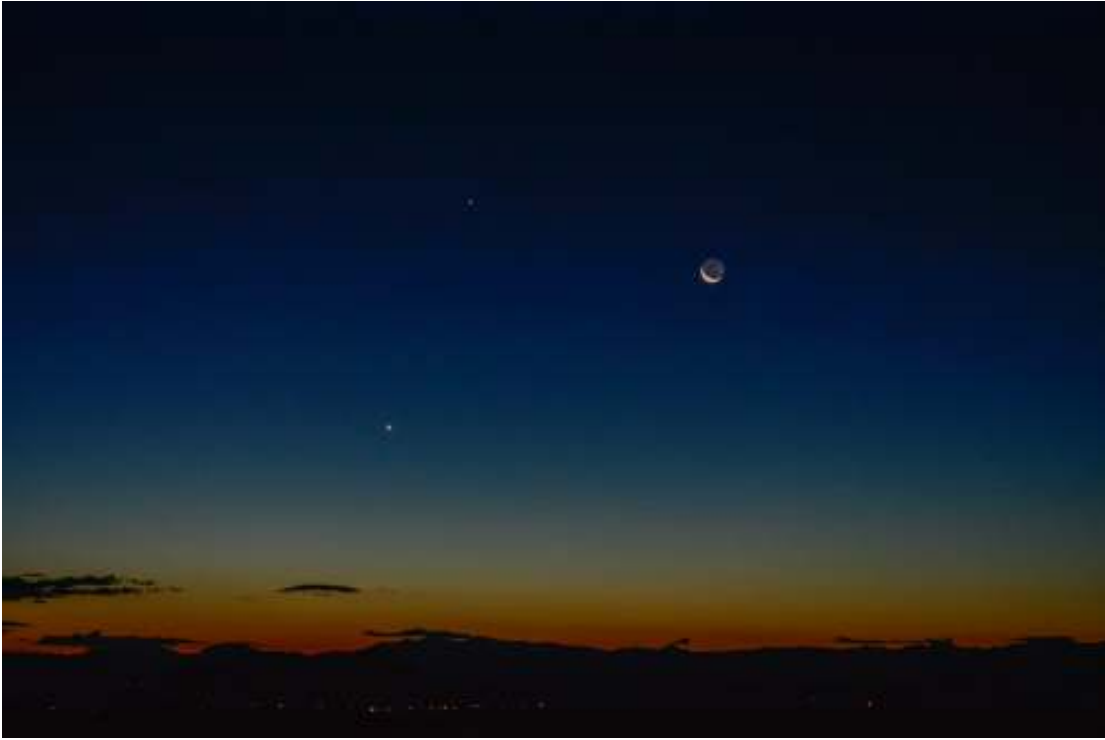
Jupiter, Moon, and Venus