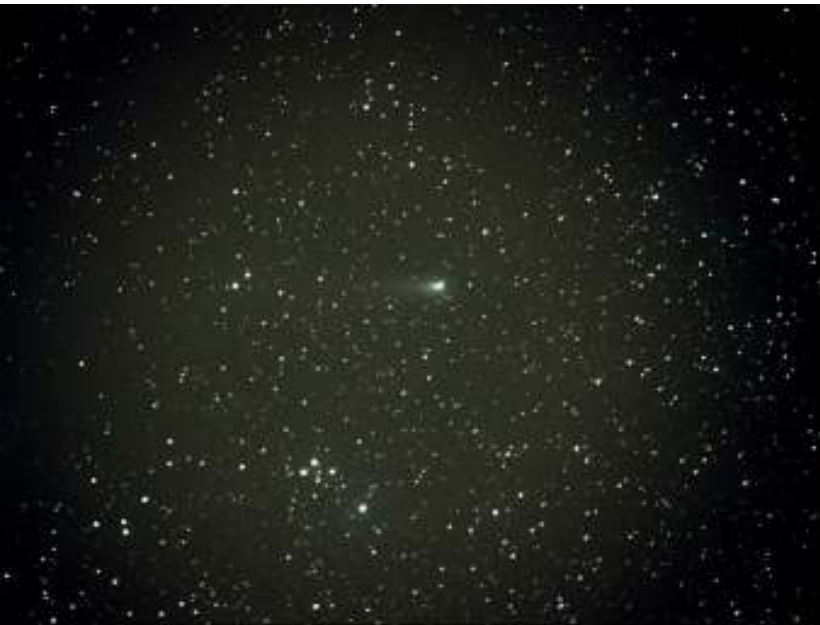
Comet Oukaimeden