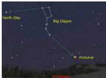
The location of Arcturus

Of all the stars visible to our unaided eye, Arcturus is the third visually brightest having nearly the same Absolute and Apparent magnitudes. This is because it is situated very near to 32.6 light years (10 parsecs), the point where all celestial objects are theoretically placed, and using the Inverse Square Law of Luminosity , their Absolute Magnitudes are determined.