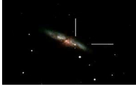
A supernova in the galaxy M-82

During our last meeting, there was an excellent presentation of photometry of the supernova in the galaxy M-82. I was curious as to the intrinsic or Absolute Magnitude (“M”) of such a cataclysmic explosion, where the visual or Apparent Magnitude (“m”) peaked at 10.5 (according to data just released by Sky & Telescope magazine) from a distance of 13 million light years, or 3,987,730 parsecs (1 parsec = 3.26 light years).