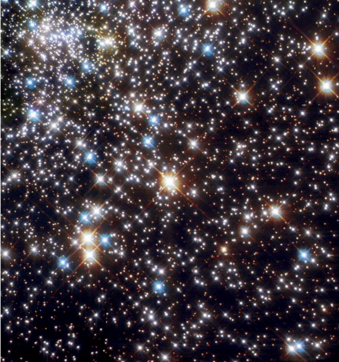
Globular Cluster NGC 6397.