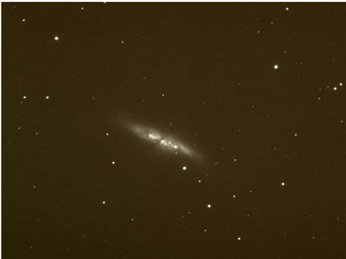
Supernova 2014J in M82 by Rich Swanson