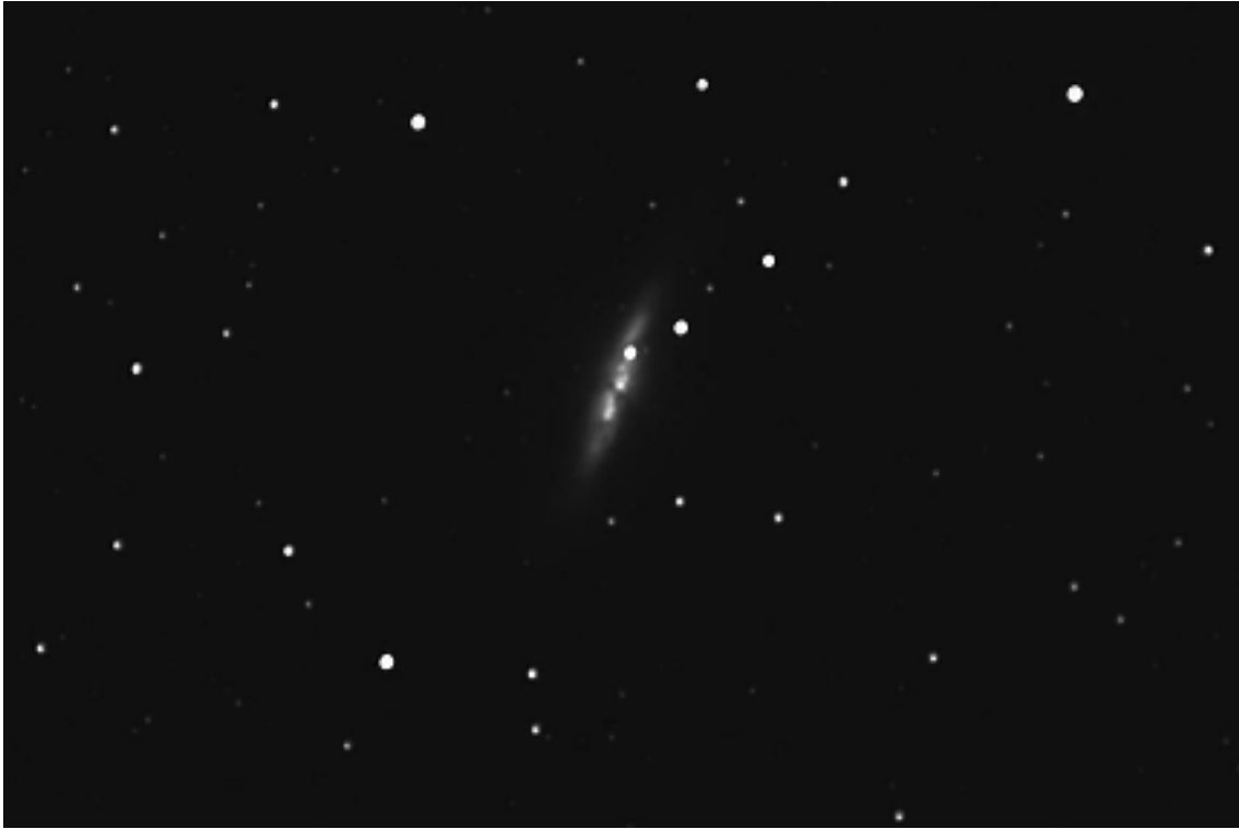
Supernova 2014J in M82